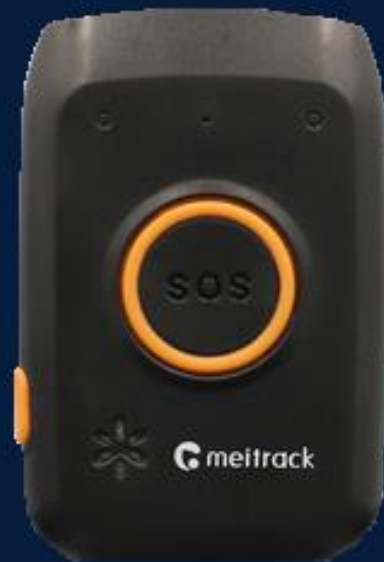
MEITRACK P88L covert operation